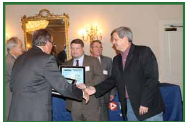
Excellence in Workforce Hauck Manufacturing I. Auman Machine