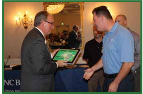
Excellence in Sustainability SPX Cooling Technologies