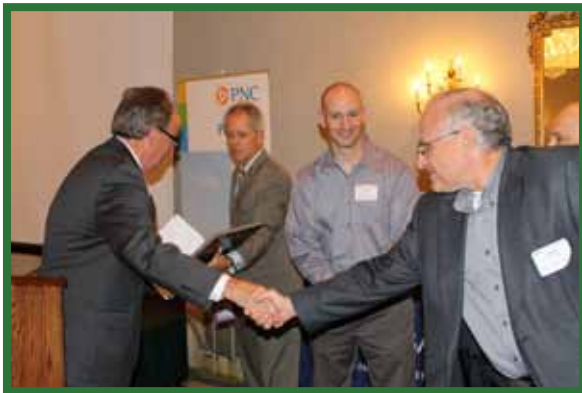
Excellence in International Trade PoolPak Technologies Corporation