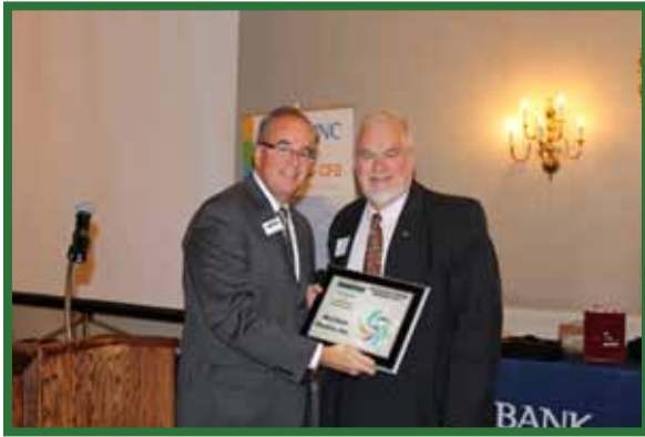
Excellence in Continuous Improvement McClarín Plastics