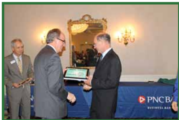
Excellence in Technology Acceleration S E Moulding