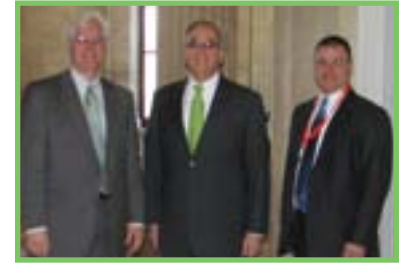
MANTEC attends Hill Day to ask legislators to support manufacturers