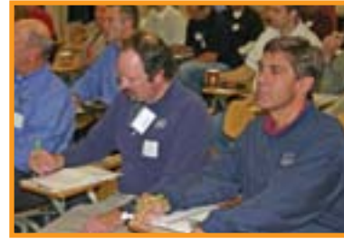
LEAN Working Group participants learn about Glatfelter's initiatives