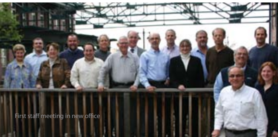
First staff meeting in new office